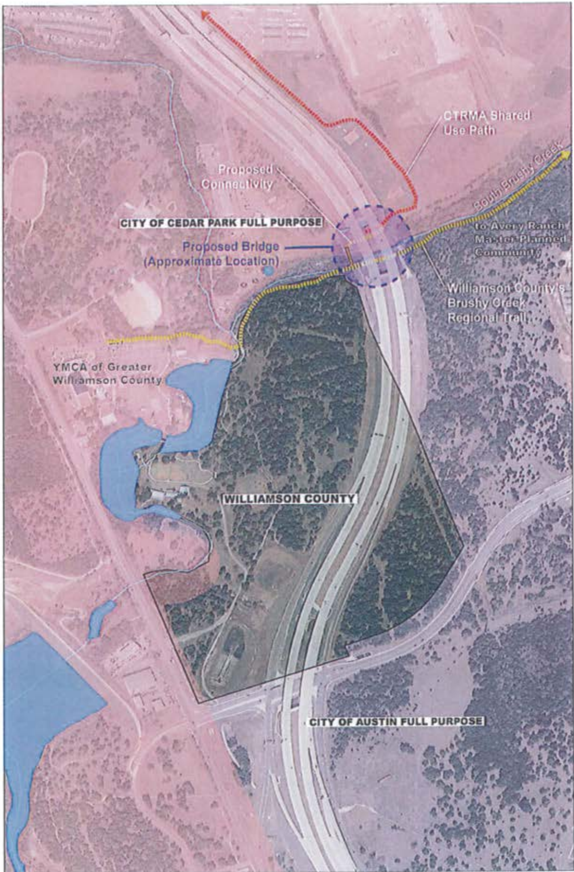
South Brushy Creek Pedestrian Bridge Location Map