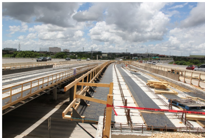
Placing Deck Forms for Southbound MoPac Bridge over Capital Metro Red Line - June 15