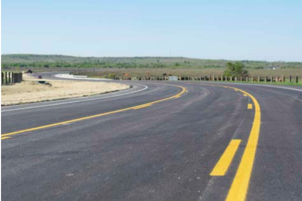
Final Kellam Road open to traffic