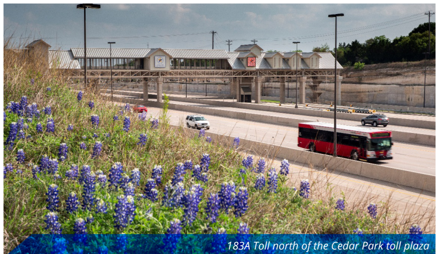
183A Toll north of the Cedar Park toll plaza

Although minor issues were noted, the inspection conducted in October 2016 did not identify any major deficiencies in the asphalt pavement that affect the safety and operations of 183A. It should be noted that the northbound and southbound frontage roads from RM 1431 to approximately 1000