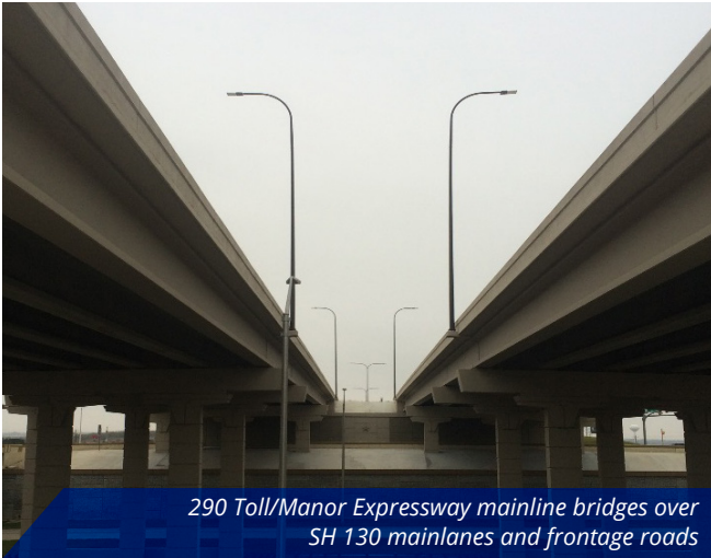
290 Toll/Manor Expressway mainline bridges over SH 130 mainlanes and frontage roads

Based on a review of the most recent inspection reports and visual observations, 290 Toll/Manor Expressway bridges are in adequate or better condition.