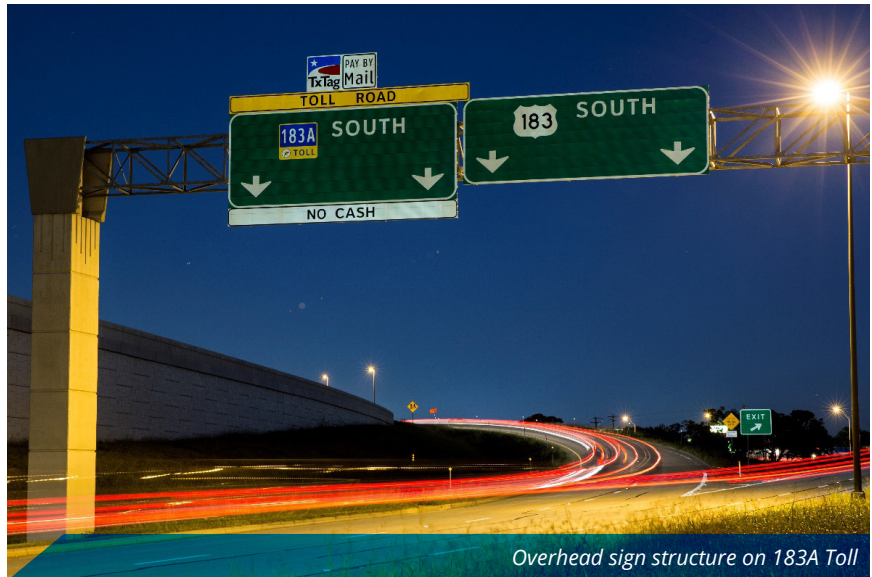
Overhead sign structure on 183A Toll

The inspection did not reveal any unsatisfactory deficiencies in the condition and operation of the toll gantries and sign structures.