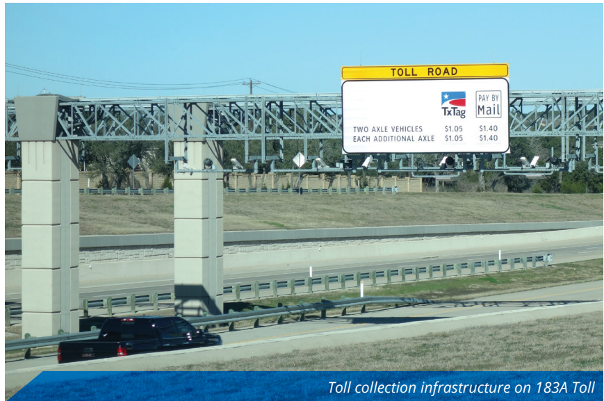
Toll collection infrastructure on 183A Toll

As discussed in Section 2.2.4 (Buildings), the visual inspection of the building and civil site aspects of the toll system infrastructure indicates that the primary components are in adequate or better condition. In addition, as discussed in Section 2.2.6 (Overhead Sign Bridges), the toll gantries are in adequate or better condition. Other elements associated with the toll infrastructure listed above were found to be in adequate or better condition. Efforts should be made to continue to keep all components clean, well maintained, and secure for the TCS.