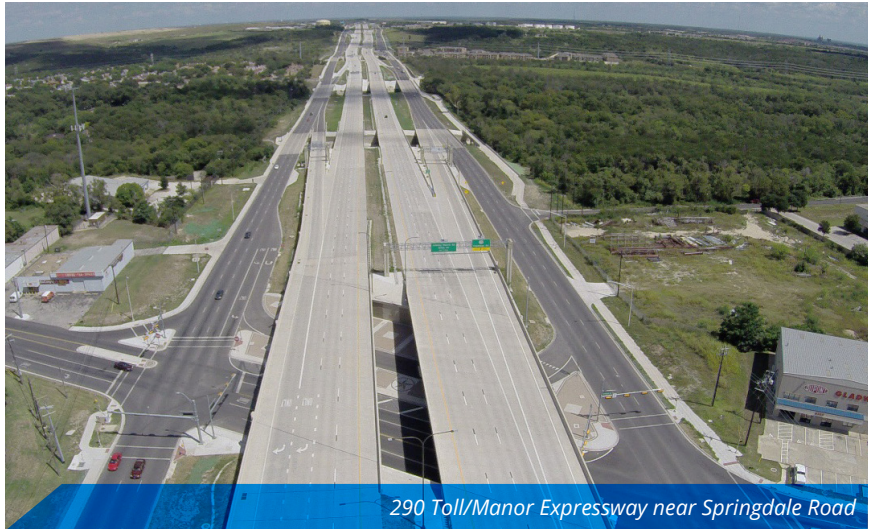
290 Toll/Manor Expressway near Springdale Road

The Mobility Authority constructed, operates and maintains the 290 Toll Road/Manor Expressway, a 6.2-mile limited access toll road spanning from US 183 to just east of Parmer Lane. The all electronic toll collection corridor is a significant link to important roadways in the region including US 183, I-35 and SH 130 and provides a critical evacuation route from the Gulf Coast. The first phase of 290 Toll/Manor Expressway, which consists