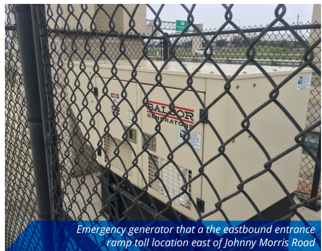
Emergency generator that a the eastbound entrance ramp toll location east of Johnny Morris Road