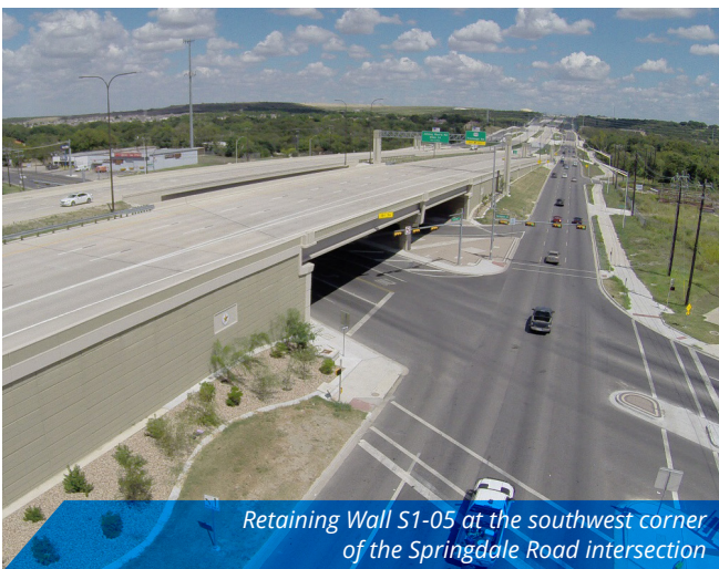
Retaining Wall S1-05 at the southwest corner of the Springdale Road intersection

The fall 2016 visual inspection did not identify any deficiencies that affect the safety and operations of the facility. The majority of the defects noted were vegetation growth causing minor drain obstruction and evidence of minor panel misalignment, as well