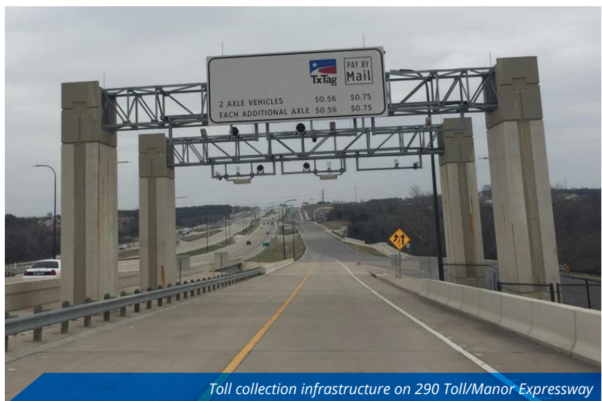
Toll collection infrastructure on 290 Toll/Manor Expressway

As discussed in Section 2.3.4 (Buildings), the visual inspection of the building and civil site aspects of the toll system infrastructure indicates that the primary components are in adequate or better condition. In addition, as discussed in Section 2.3.6 (Overhead Sign Bridges), the toll gantries are in adequate or better condition. Other elements associated with the toll infrastructure listed above were found to be in adequate or better condition. Efforts should be made to continue to keep all components clean, well maintained, and secure for the TCS.