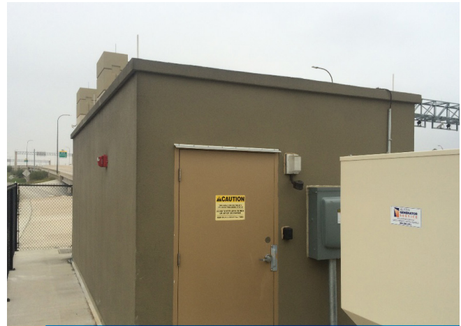
ILP building located at the Parmer Mainlane tolling location

The GEC was unable to gain access to the building interior at the mainlane Parmer ILP due to issues with the door hardware, therefore, this building was not inspected.