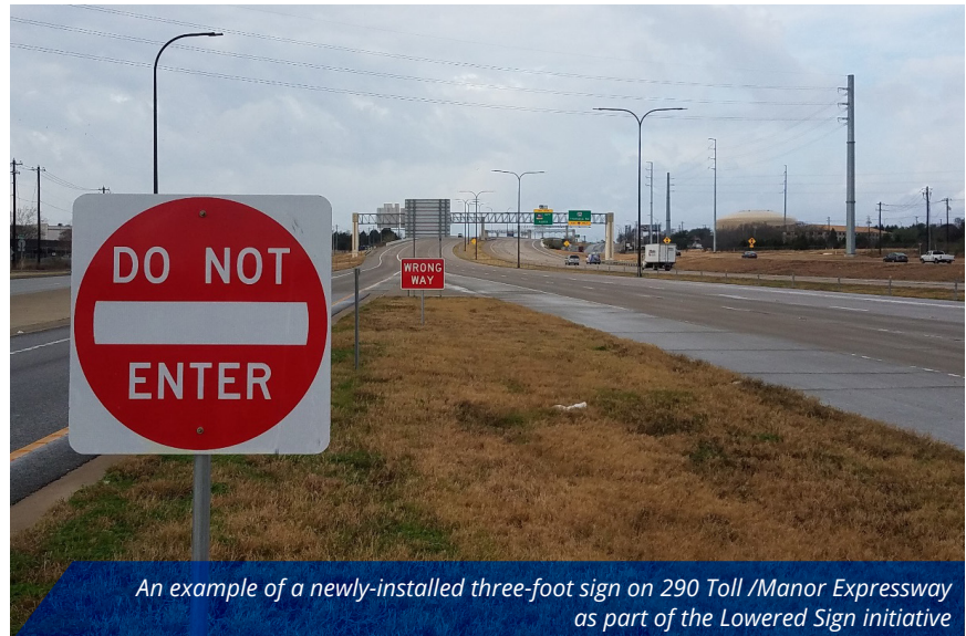
An example of a newly-installed three-foot sign on 290 Toll /Manor Expressway as part of the Lowered Sign initiative

In late 2016, in an effort to prevent drivers from entering a highway going the wrong way, the Mobility Authority began lowering Wrong Way (WW) and Do Not Enter (DNE) signs at the at the exit ramps of 183A Toll and 290 Toll/Manor Expressway, System-wide. The signs are being lowered from the current seven foot-height to the MUTCD-approved three foot height. The initiative was based on research done by the Texas A&M Transportation Institute which found that many