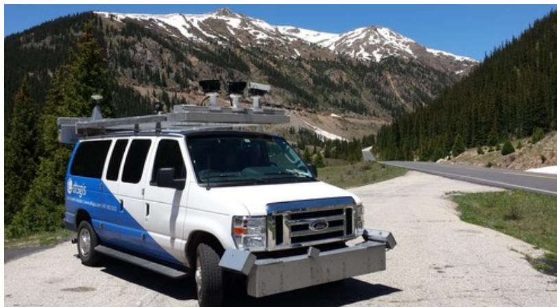
Mobile Asset Collection (MAC) Vehicle

CONSULTANT's Mobile Asset Collection (MAC) vehicles will collect right-of-way asset inventories. The vehicles will capture images at an interval of approximately 10 to 15 feet for both forward and side-facing directions and geo-referenced to the shapefile by segment. The CONSULTANT will collect data by driving our MAC vehicle in the project area. CONSULTANT proposes to use its MAC LRIS vehicle line scan camera with laser illumination and four right-of-way cameras to capture ROW images.