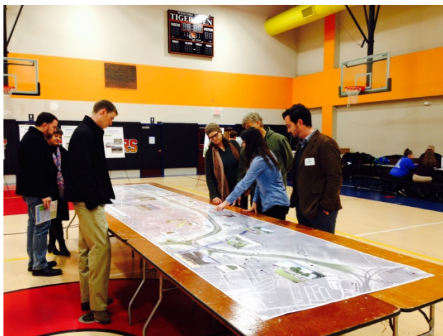
Bergstrom Expressway Open House at East Austin College Prep

Representatives from The Mobility Authority and TxDOT on Thursday, Nov. 13 hosted community members for an Open House on the Bergstrom Expressway Project.